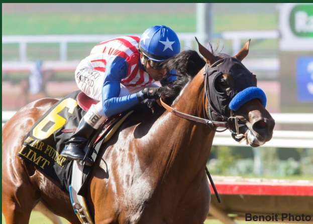
March '16 Grad Kilit winning the G1 Del Mar Futurity.