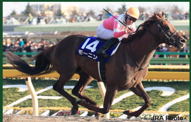
March '14 Grad Moanin winning the G1 February Stakes at Tokyo Racecourse.