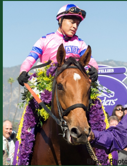
April '16 Grad Champagne Room winner of the BC Juvenile Fillies (G1)